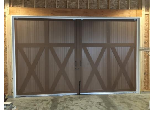
Step 1: Remove any existing weather stripping from the inside of the barn door.